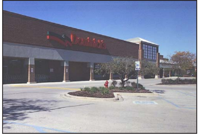
Safeway safeguards its inventory and income stream using Generac generators for backup power at many of its supermarkets.

“A power outage is something that would impact our business significantly,” says JeNyce Boolton, a spokesperson for Safeway, Inc. “Not only would our customers be inconvenienced, but much of our refrigerated and frozen food might be harmed. The loss of sales would be considerable also. Having a generator onsite allows us to keep operating to avoid those kinds of problems and losses.”