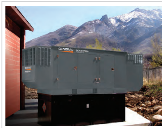
The new Generac Industrial Power enclosures feature a rugged exterior coating in dark gray and are marked with our new logo.

specification sheets visit www.generac.com or contact your local Generac Industrial Power sales representative.