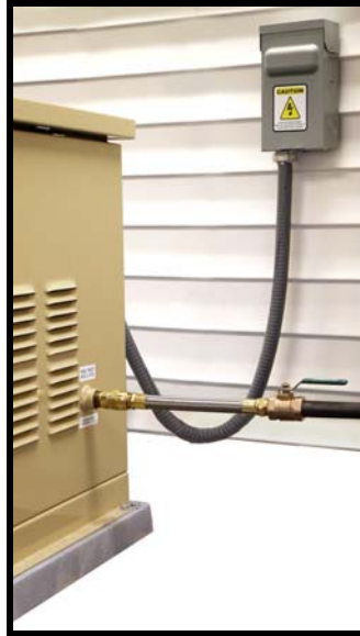
Fuel line connection with steel braided flex fuel line