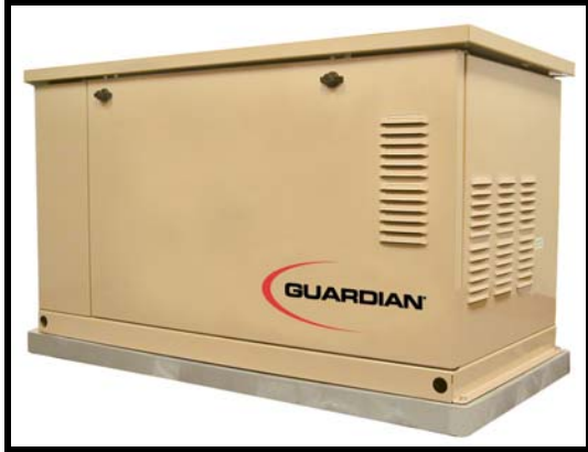
Guardian Air-Cooled Standby Generator